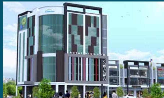
8 storey office tower