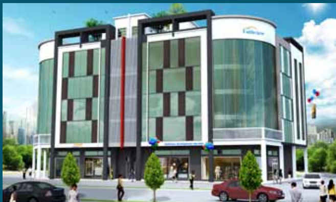
5 storey office tower