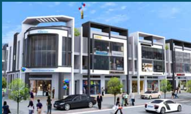
3 storey shop office